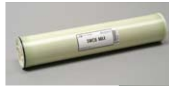
"Energy-saving and low cost" reverse osmosis membrane element "SWC™6-MAX" used for seawater desalination

Despite the difficult business environment, we have managed to bring new products onto the market. An example of this being the creation of the world's most energy efficient seawater desalination product, boasting an effective membrane area that is 10%