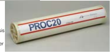
"Ultralow pressure and low contamination" reverse osmosis membrane element "PROC™20" for industrial water to be used in China

larger than existing products. Another is a new product which allows raw water containing saline matter and pollutants to be filtered, where the power consumption required for the process is 30% less than that required by existing products. Based on an assumption that there will be increases in future demand, a new reverse osmosis membrane manufacturing plant began operating in 2009 within the Shiga Plant in Kusatsu City in Shiga Prefecture.