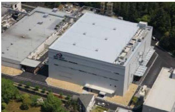
New factory in Shiga Plant

As for reverse osmosis membranes, business deals for seawater desalination plants with Algeria, Spain, Saudi Arabia, India, China, Australia and so on were strong and progressed favorably, making up for decreases in new deals for industrial use in the manufacturing process of semiconductor materials and liquid crystal