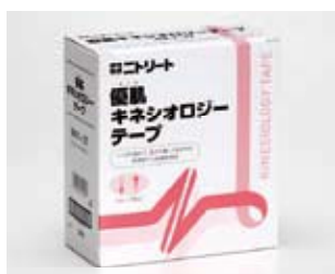
NITREAT Kinesiology Tape