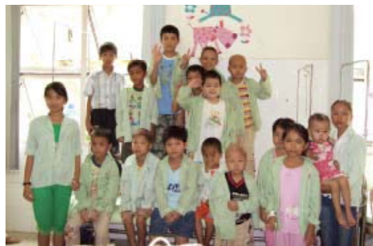
The pediatric cancer ward of Hue Central Hospital in Vietnam

In response to a request by the "Asia Child Care League", an NPO supporting pediatric cancer patients and their families, the Nitto Denko Group has donated three years' worth of Transdermal Patches for local anesthesia. Children are scared of injections, and we wanted to do whatever we could to relieve their suffering and empower them in their battle against cancer. The patch, a type of transdermal pharmaceutical which produces local anesthetic effects, reduces pain by merely being put on the skin before injections.