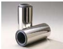
Transparent conductive film ELECRYSTA®

We will expand our business even more in the field of small and medium sized products such as mobile phones and portable music players, through mobilizing all of our unique accumulated technologies such as Transparent Conductive Film for touch panels.