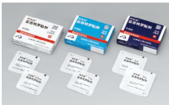
Transdermal bronchodilator therapeutic patch for asthma

* Nucleic-acid drugs: Nucleic acid, indispensable for heredity, survival and breeding, is the most significant chemical substance for living organisms, a high-molecular substance composed of Nucleic acid base (purine and pyrimidine), Pentose (Ribose or Deoxyribose) and phosphoric acid. Drugs manufactured from this substance are called "nucleic-acid drugs."