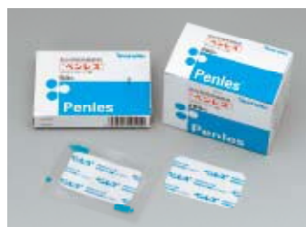
Transdermal Patch for Local Anesthesia