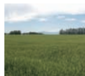
A wheat field in Czech Republic

The new Czech industrial park was built on cleared land. The excavated soil not needed for the building of our plant was given to neighboring farm families and is now being used in wheat fields.