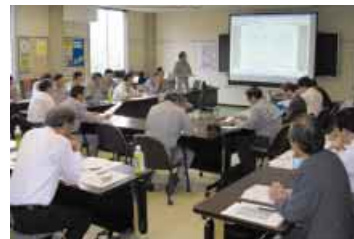
The Nitto Denko Group endeavors to share information through the environmental safety committee