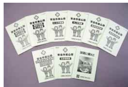
Booklet "To prepare for earthquake," etc.

An anti-earthquake procedures manual is provided at each plant, how to handle hazardous goods in case of an earthquake is thoroughly shared by the staff, and the manual is reviewed as required. Evacuation drills are regularly executed.