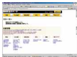
Intranet. "Environment and Safety Page"

As for sharing information, "Environment and Safety Page" was opened on the company's intranet in November 2003 (in English and Japanese). This helps not only sharing environment and safety information among Japan domestic plants but also sharing it among domestic/overseas group companies. If any occupational accident should occur, a prompt report of the accident would be communicated via the intranet to prevent the recurrence of the same accident.