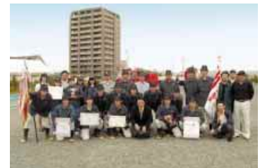
Each plant organizes a voluntary firefighting team

the fire broke out. At the same time, the information is shared by the group companies to take measures on similar facilities.