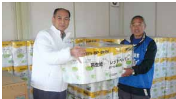
Relief supplies: 20 oil fan heaters and 520 packs of 12 rolls of toilet paper

This is an event whose goal was to walk 1,000,000 steps in 100 days from last October to the day of the Osaka International Ladies Marathon. Although it has been an annual event since our first year of co-sponsorship of the marathon, we also made donations of relief supplies to areas affected by the Great East Japan Earthquake based on the total distance walked by the participants. With the aid of many participants, we donated relief supplies worth 300,000 yen in response to the total combined distance of 290,000 kilometers walked by all participants, to Sendai Tsunami Fukko Shien Center.