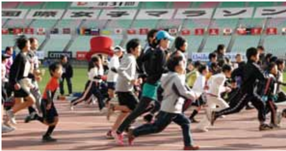
The 3.2- km “Osaka Enjoy Run” jogging event

This year we cosponsored “Osaka Enjoy Run” in which entrants from elementary school students to the elderly were able to participate. With Naoko Takahashi, gold medalist in the women’s marathon at the Sydney 2000 Olympic Games as a special guest, 1,417 participants enjoyed jogging at their own pace.