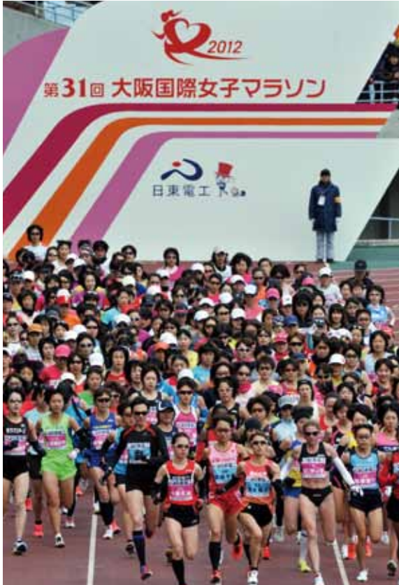
The start

31st Osaka International Ladies Marathon