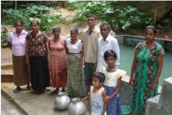
Wells completed in Sri Lanka

We have so far donated 7 wells to developing countries in Asia, such as Sri Lanka and Bangladesh. This year, in the third fund-raiser for digging wells, we raised 700,000 yen. We made donations through the Japan Asian Association and the Asian Friendship Society. The funds will be used for the construction of wells in the Philippines, Cambodia and Nepal.