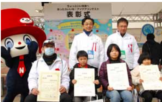
Idea Contest award ceremony

We held a “Creating a better future with ideas! Idea Contest” as part of activities in conjunction with the Osaka International Ladies Marathon. In order to make our lives more convenient and a little more comfortable, we called for ideas for eco things that people would like to see exist. We received a total of 418 submissions. After