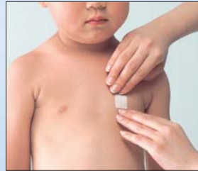
Transdermal therapeutic patches for asthma treatment