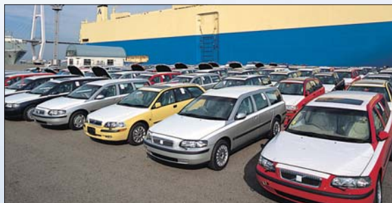
Surface protection films for automobiles

The Nitto Denko Group provides offices and households, as well as the electrical, electronics, automobile, housing, construction, and many other businesses, with various adhesive tapes based on the adhesive processing technology cultivated in the development and production of adhesive tapes, including anticorrosion and waterproof materials, sealing products, bonding and joining products, and surface protection materials.