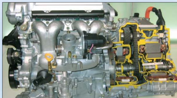
Hybrid-car motor insulation materials