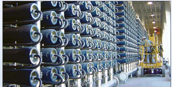
Reserve osmosis membrane for seawater desalination

The functional product segment supplies many products to the medical and sports fields, including transdermal therapeutic patches releasing medication through the skin into the body and medical and athletic taping. The polymer separation membrane technology provides products contributing to environmental conservation like securing water resources and separation of water and medicines.