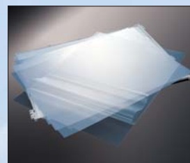
Surface protection film for electronics and optical materials (E-MASK)