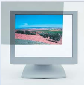
LCD optical film

The adhesive processing technology and the polymer synthesis technology are also utilized in the electric/electronics field. The group's products serve a diverse range of segments within the electronics industry, including semiconductor-related products that make a variety of devices function, LCD-related materials such as polarizing films, flexible printed circuit products, and electronic process materials.