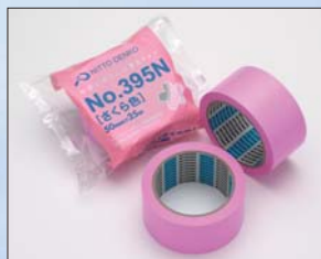
Curing tape for flooring