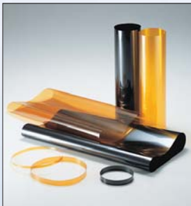
Polyimide seamless belt