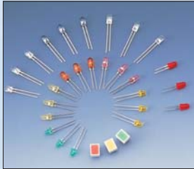
Transparent epoxy encapsulating resin