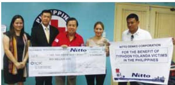
Donating to the Philippine Red Cross

We are eager for the reconstruction of disaster areas without further delay.