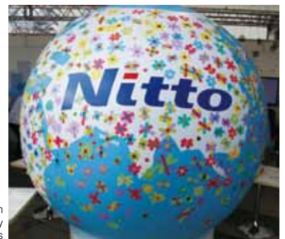
A balloon from Nitto Dream Flower Earth bearing many dreams and wishes

We set up a sponsor’s booth which introduced our technology and production techniques on the very day of the marathon. Coined Nitto Dream Flower Earth, we held an event in which we had visitors post stickers and masking tape to terrestrial balloons, on which each visitor wrote down his or her dream or wish. Later, the balloons with their many dreams and wishes were brought to Sumiyoshi Shrine, with the aim of bringing good luck.