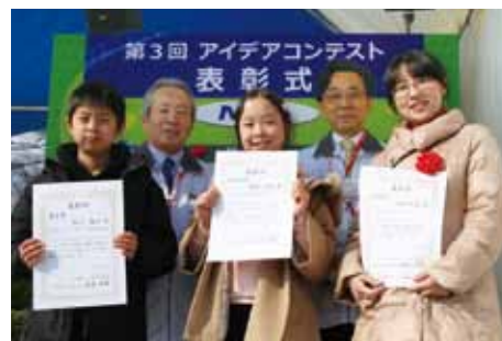
Idea contest award ceremony

At the event site, we exhibited a piece of demonstration equipment illustrating the idea of “Kimochi Tebukuro,” which received the highest award last year.