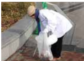
A Volunteer cleans the site