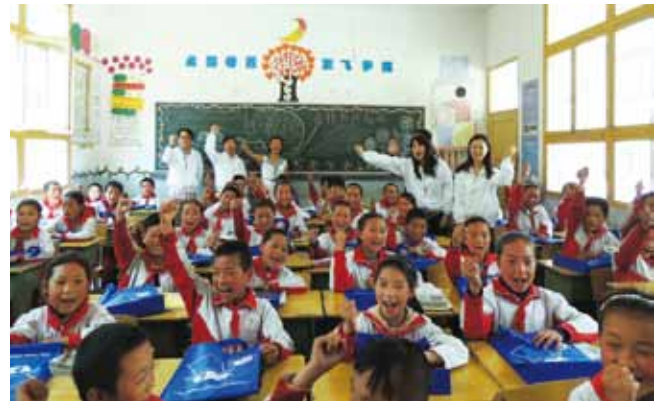
Children of Sichuan Central Primary School

On December 20, 2013, “Nitto Personal Computer Room” was established at Shanghai Songjiang Shanrong Primary School, which is a school for children of migrant workers. It is a classroom using recycled personal computers from each group company.