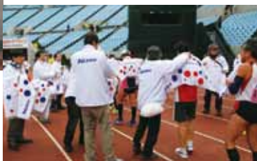
Volunteers drape towels over runners in the Osaka Half Marathon