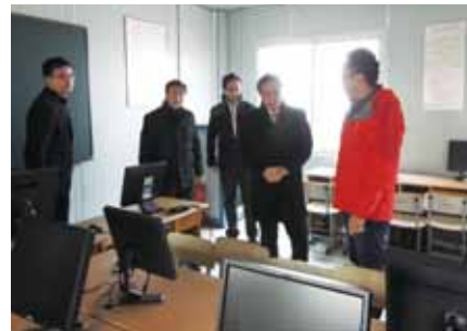
Nitto Personal Computer Room