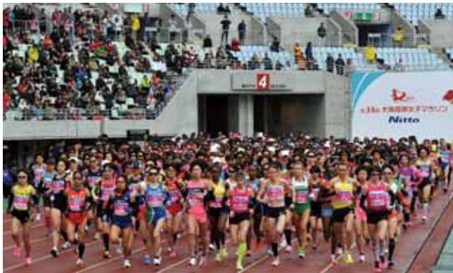
The start

The Nitto Group supports each runner striving hard towards his or her goal.