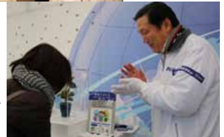
Exhibit of “Kimochi Tebukuro,” with which we understand the feelings of people and things by touching them.