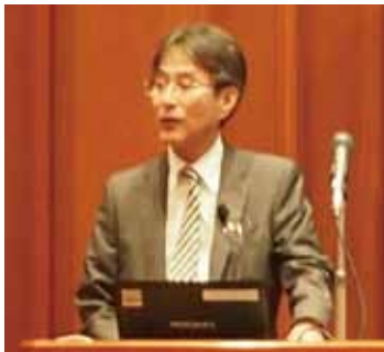
A Nitto employee giving a presentation at the international symposium

At the international symposium and under the theme of life science, several findings were presented. On the final day, participants were invited to Ibaraki Plant, where they deepened interchanges by looking around our prototype room and were introduced to our technology through a demonstration. We also consulted on how to carry on an academic-industrial alliance. It was a good opportunity to discover common ground.