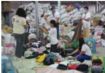
Volunteers sort items

Subsequently on November 27, the Nitto Group also donated 10,000,000 yen to the Philippine Red Cross. Nitto Denko Singapore donated SGD 3,000 to the Singapore Red Cross in the form of a contribution from the company, matching a donation made by employees, while Nitto Denko Automotive Virginia donated USD 666 to the U.S. Red Cross.