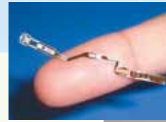
Thin-film metal base board with high resolution circuit - CISFLEX®