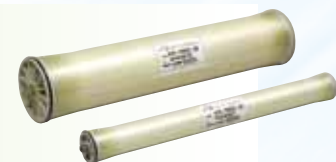
Seawater desalination spiral RO membrane element