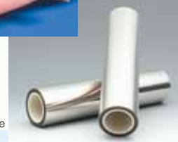
Transparent conductive film - ELECRYSTA™