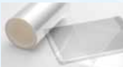
Surface protective materials - E-MASK®