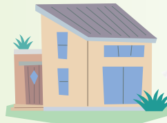
Waterproof and airproof taping - HYPERFLASH™

Adhesive tapes are used in diverse housing-related applications based on key concepts, such as "air-tightness", "waterproofing", "soundproofing", "masking" and "surface protection".