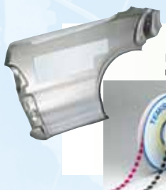
Steel plate reinforcing materials - NITOHARD™