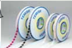
Internal pressure regulator - TEMISH®