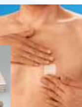
Transdermal drug delivery patches