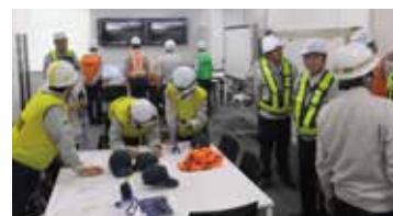
Training session at a disaster prevention center

Furthermore, we have established disaster prevention centers in main bases such as Kameyama Plant, in preparation for a contingency.