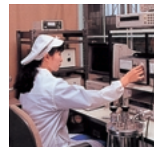
■ Electrical conductivity assessment