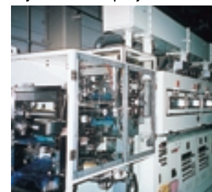
■ Solvent-free adhesive tape prototype fabrication machine

Along with developing technology for improving production by enhancing speed and precision, the Production Engineering Departments of company plants and the Production Engineering Development Center are involved in establishing mass-production technology from the initial stage of product development in cooperation with the Research and Development Division. The Production Engineering Departments and the Production Engineering Development Center are also involved in developing technologies to reduce industrial waste based on the results of the previously described project for reducing value of industrial waste.