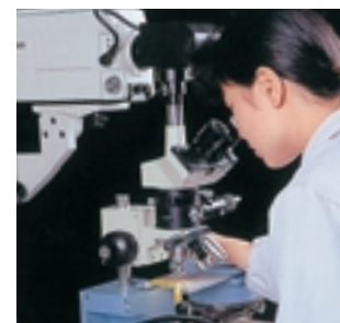
■ Observing adhesive tape through an optical microscope

From the perspective of "expanding business opportunities through development of environmental technologies," the research and development departments of the main office and its divisions/departments have established technologies for reducing solvents and eliminating lead and halogen, and are developing products that help reduce impact on the environment.