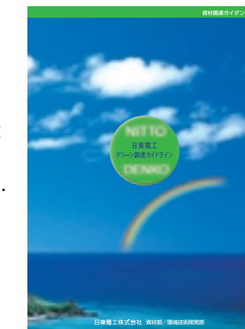
■ Green procurement guidelines

The guidelines are posted on our Web site at ( http://www.nitto.com )