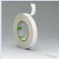
Double sided rubber tape

We supply components used in a variety of home electrical appliances, including audio visual systems, mobile devices and LED lights.