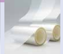
LUCIACS® Transparent double sided adhesive tape