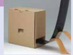
HYPERFLASH™ Waterproof and airproof tape