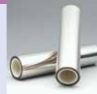
ELECRYSTA™ Transparent conductive film

We provide peripheral materials for high-definition displays with the newest technologies.