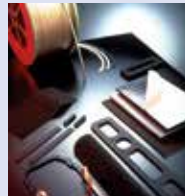
NITTO EPTSEALER™ Foam sealing material