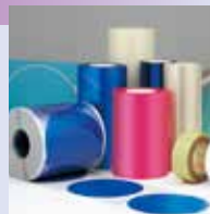
ELEP HOLDER™ Adhesive tape for protecting and fixing semi-conductor wafers