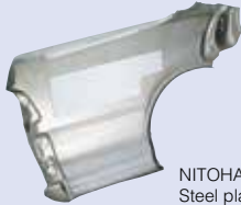
NITOHARD™ Steel plate reinforcing materials

Our products improve the performance and product efficiency, as well as reduce the environmental impact, of transportation equipment such as automobiles, trains and aircraft.