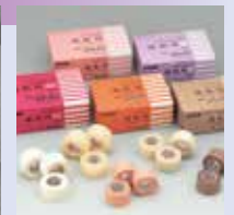
Yu-Ki Ban™ Medical hygiene materials