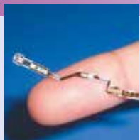
CISFLEX® Thin-film metal base board with high resolution circuit

We satisfy our customers' needs with our wide-ranging products, from processing materials to peripheral materials.