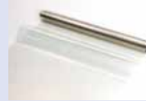
PENJEREX® Energy-saving window film with solar control and thermal insulation

Our products provide various solutions to improve the security, comfort and environmental performance of housing.