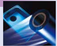
SPV® Surface protective material