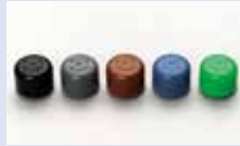
TEMISH® Internal pressure regulator