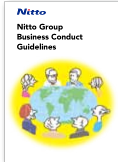
Business Conduct Guidelines

With the progress of globalization in business, we continue to observe an increase in the diversity of people employed by the Nitto Group. Even with differing cultures, customs and regions, we believe that it is indispensable for our employees to understand compliance at a certain level. In the Nitto Group we translate our Business Conduct Guidelines , starting with a commitment by the CEO, into 16 different languages and distribute and explain them to all employees to enhance their awareness of compliance.