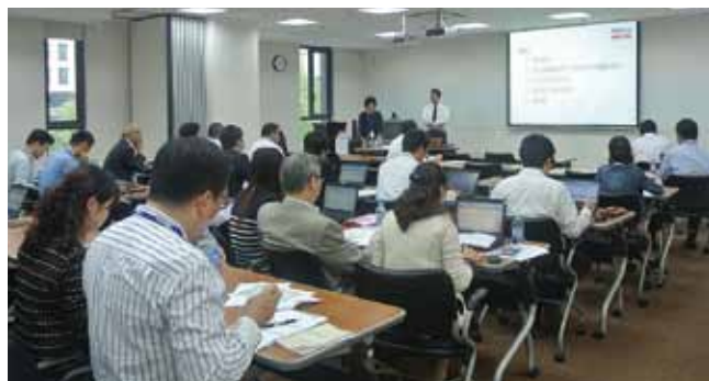
Enhancing awareness by sharing information at a workshop in East China

CSR workshops held every year offer a forum for each management level employee to consider compliance issues with regard to the results of and examples in our questionnaire on compliance and business risks. In fiscal 2013, the workshops were held at a total of 128 bases in 29 countries and territories, with 2,120 management level employees participating in them.