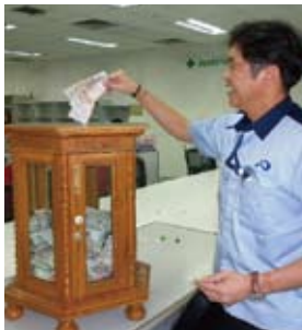
Fund-raising activity in Nitto Denko Material (Thailand) Co., Ltd.

Employees of the Nitto Denko Group throughout the world made monetary donations. The proceeds from their fund-raising and each matching company donation were donated to the Red Cross Society in each country. The total monetary donation from the whole Group was 63,000,000 yen, half of which was from employees.