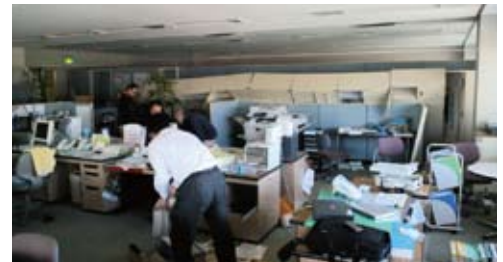
Office of Nitto Denko Tohoku Sales Branch in Sendai-shi The cabinet was fixed to the wall but fell because of the violent shaking of the earthquake.