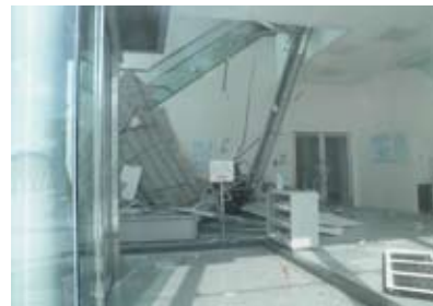
Damage to the Nitto Denko Tohoku Plant Part of the ceiling above the stairs in the building collapsed.

At the Nissho Iwaki Plant, there was no major damage to buildings or other facilities. However, because of the disruption to utilities and the Fukushima crisis*, production was partially interrupted. On March 22, it was restored.