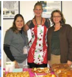
Bake sale as one of the fund-raising activities in Hydranautics, U.S.