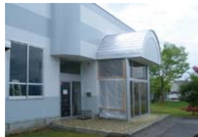
Nissho Iwaki Plant The glass in the entrance was broken. (Part covered with film)