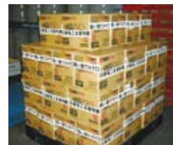
Disposable body warmers sent to devastated areas

12,000 disposable body warmers made of our porous film