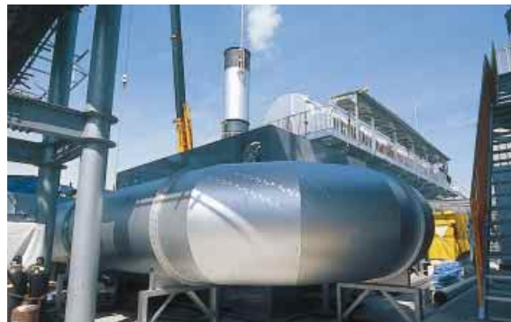
New deodorizing furnace under construction at the Onomichi Plant

We have examined the possibility of introducing an energy control system. The system enables every user to easily monitor real-time energy consumption to eliminate the waste that has been overlooked and to detect abnormalities and problems at the earliest occasion. The system is planned for introduction in turn, starting from the Shiga Plant in fiscal 2004.