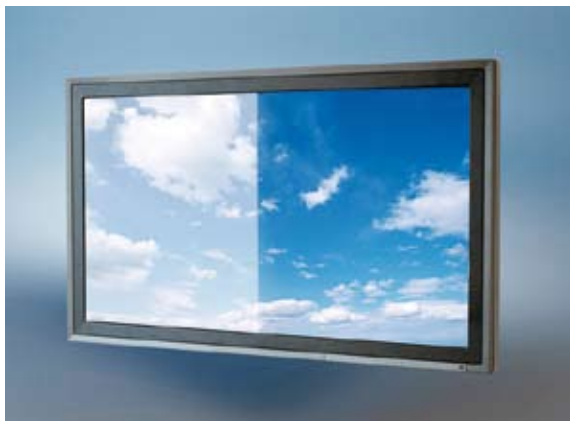
Optical films for LCD

We were able to respond promptly to the demand for big screen televisions in Japan, Europe and USA and the replacement demands of CRT-based televisions in developing countries. Furthermore, new LCD televisions which load LED (semiconductors called light-emitting diode) backlights were introduced onto the market. These devices have enjoyed popularity due to their slim lines, being lightweight, having a vivid image and low power consumption. Our optical films have and continue to play a part in the popularity of the new LCD's.