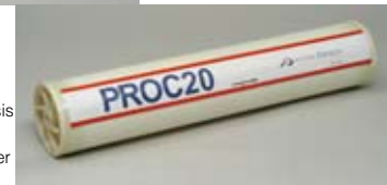
"Ultralow pressure and low contamination" reverse osmosis membrane element "PROC TM 20" for industrial water to be used in China

larger than existing products. Another is a new product which allows raw water containing saline matter and pollutants to be filtered, where the power consumption required for the process is 30% less than that required by existing products. Based on an assumption that there will be increases in future demand, a new reverse osmosis membrane manufacturing plant began operating in 2009 within the Shiga Plant in Kusatsu City in Shiga Prefecture.