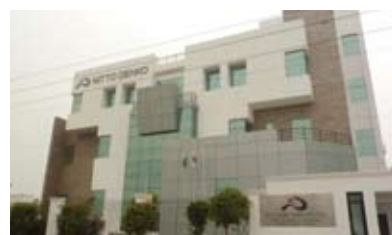
Nitto Denko India, established in November, 2009

Number of Employees: Approximately 20 (Start-up)