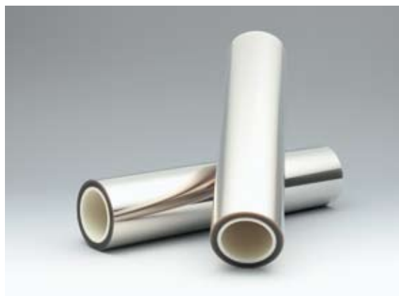
Transparent conductive film ELECRYSTA™

Throughout fiscal 2010, we will continue to contribute to innovative 3 dimensional LCD demand through fully utilizing our technological capabilities in the production of optical films.