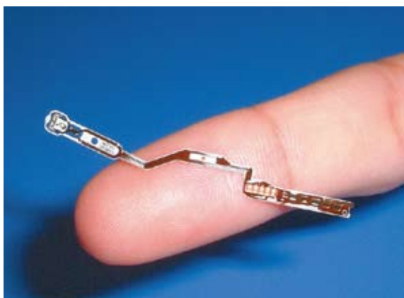
Thin-film metal base board with high resolution circuit "CISFLEX®"

Our printed circuit materials, flexible printed circuit "NITOFLEX®" and thin-film metal base board with high resolution circuit "CISFLEX®" performed well with the increase in demand for hard disc drives (HDD) used in personal computers. To date HDD have been loaded onto personal computers, but with the appearance of netbook computers, the external