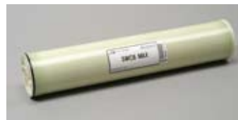
"Energy-saving and low cost" reverse osmosis membrane element "SWC TM 6-MAX" used for seawater desalination

Despite the difficult business environment, we have managed to bring new products onto the market. An example of this being the creation of the world's most energy efficient seawater desalination product, boasting an effective membrane area that is 10%