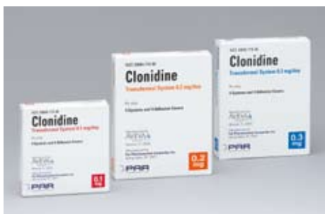
Clonidine patch (treatment of hypertension)

On 18 August 2009 Aveva Drug Delivery Systems Inc., our USA group company received authorization from the Food and Drug Administration for the clonidine patch, a transdermal drug delivery patch used to treat hypertension.