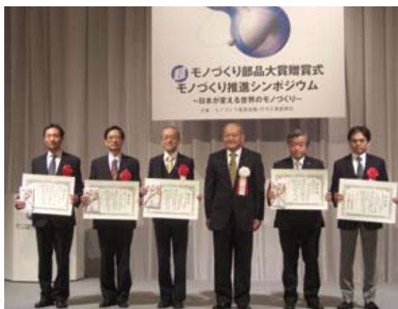
At the award ceremony, the third person from the left is a Nitto Denko employee

The characteristics of "CISFLEX®" are unique with "photosensitive polyimide" and micro wiring which takes advantage of a "semi-additive process" resulting in wiring with plating.