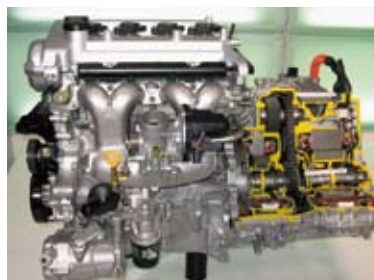
Electrical insulating materials for hybrid cars

inside of touch panels but also adjust the refractive index of light. Furthermore they contribute towards projecting a more vivid image. In order to respond to the diversifying demands associated with the spread of touch panels, we will aim to strengthen our future product lineup.